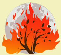
The Burning Bush Ex 3, 1-12

"I have heard their cry...I know their sufferings...Come, now! I will send you... i will be with you" (Ex 3, 1-12)