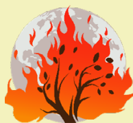
The Burning Bush Ex 3, 1-12

"I have heard their cry...I know their sufferings...Come, now! I will send you... i will be with you" (Ex 3, 1-12)