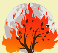
The Burning Bush Ex 3, 1-12

"I have heard their cry...I know their sufferings...Come, now! I will send you... i will be with you" (Ex 3, 1-12)