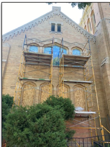
Stained glass work, West Façade

the Community Website (council minutes and community directory). You should have received an email on July 1 st for the new code. If you do not receive that email, please ask a council member for the new code.