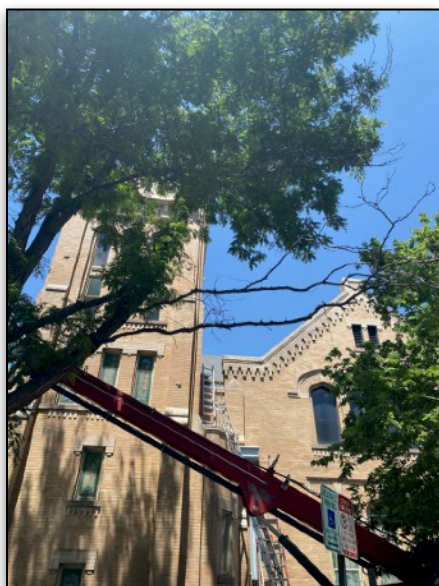
Tower, South Façade

Work on our west side stained glass has begun! You'll see scaffolding and boards on the West side of the building throughout the summer as Watkins Stained Glass does repair and restoration on the non religious windows.