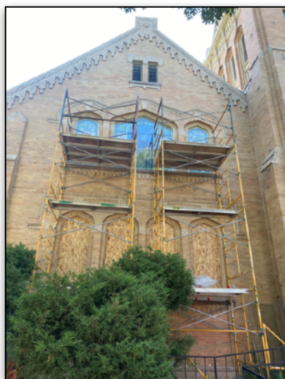
Stained glass work, West Façade

the summer months unless otherwise noted.